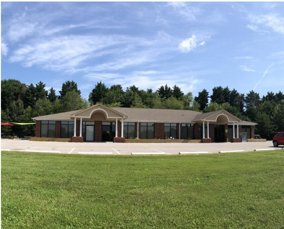
Photo of the Mt. Hermon Library in Pittsylvania County, Virginia.